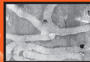
D-SHAPED EXIT HOLES

For more information on the Emerald Ash Borer: